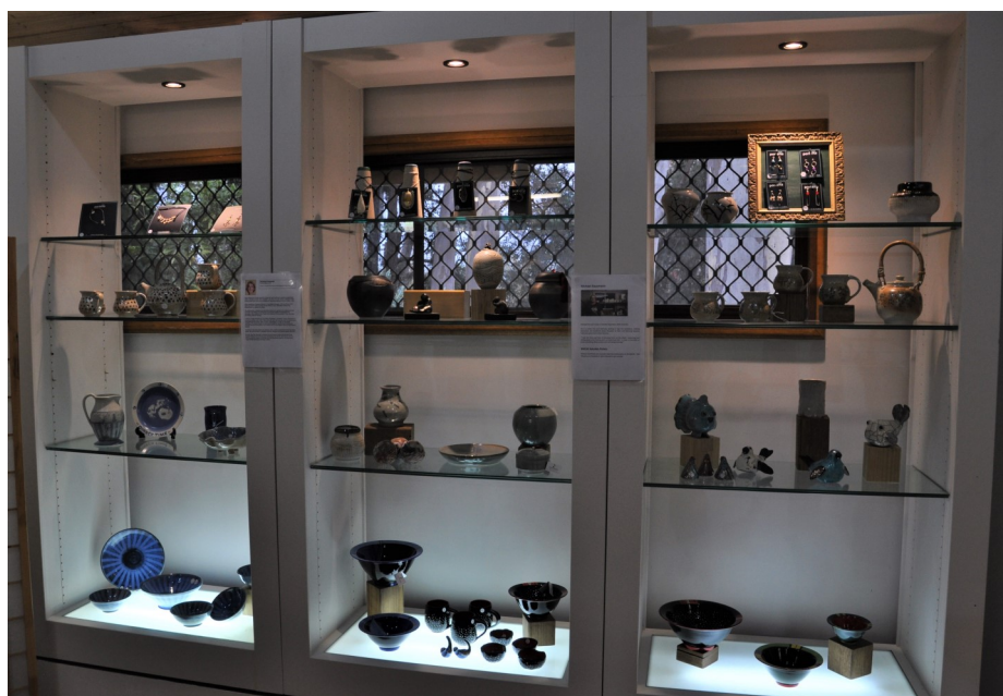
Beautiful Wares on Offer.