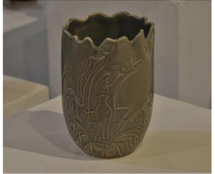
2 Vases by BRONWYN CAMPBELL