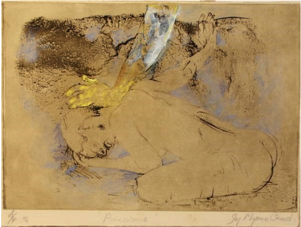
JOY MYERS CREED PRECIOUS Hand coloured photopolymer etching on paper