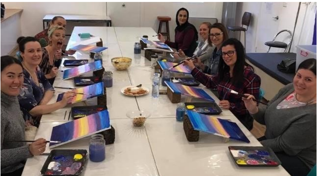
Participants in the "Paint and Sip" Workshop.