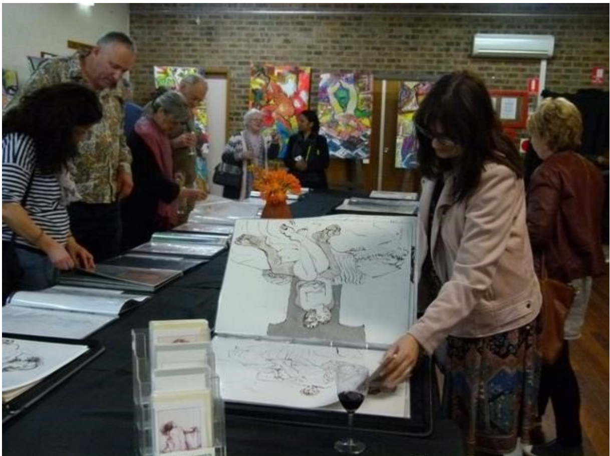
At last year's "Body and Soul" exhibition.