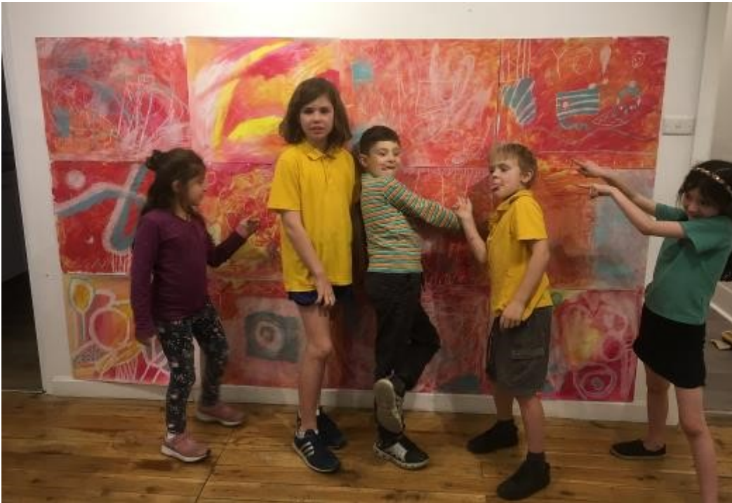
Artwork and some of the students from the Wednesday "Mixed Bag" Children's Class.

With the warmer weather and longer daylight we hope to see many full classes again next term.