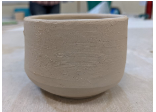
Kirrily, Thrown Cup ready for glazing.