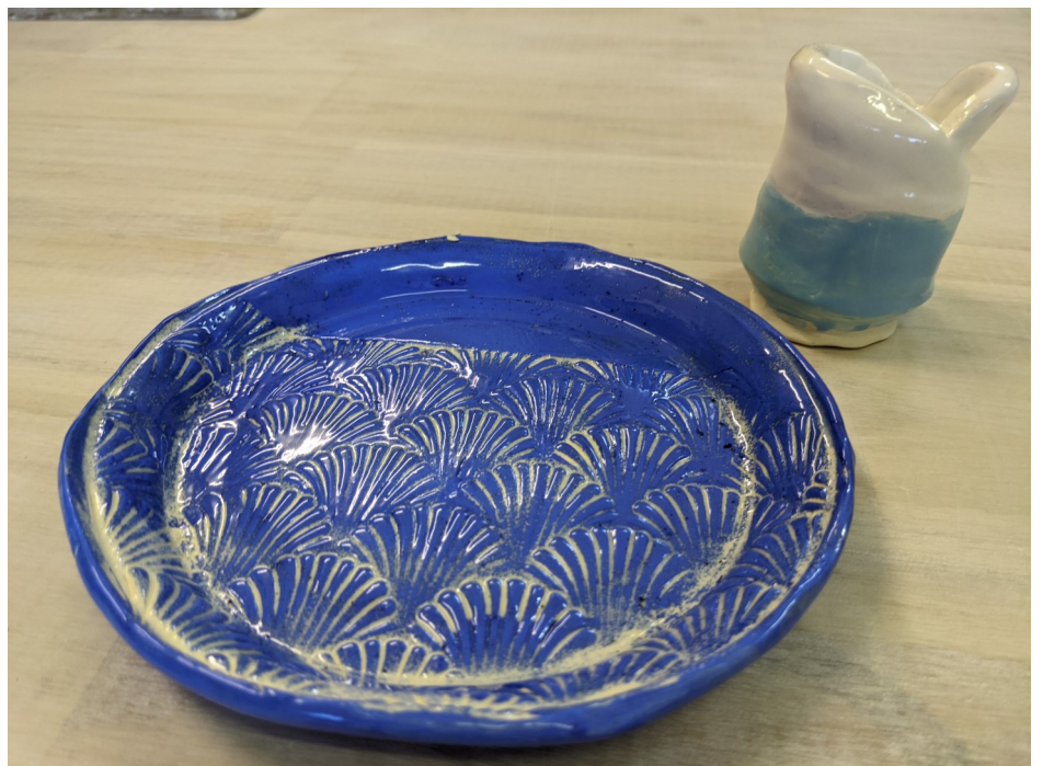
Sara, Hand-built Plate