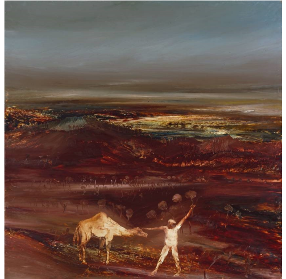
Sidney Nolan, Camel and Figure, 1966

"And I came to a bloke all alone like a kurrajong tree. And I said to him: 'Mate - I don't need to know your name - Let me camp in your shade, let me sleep, till the sun goes down.'"