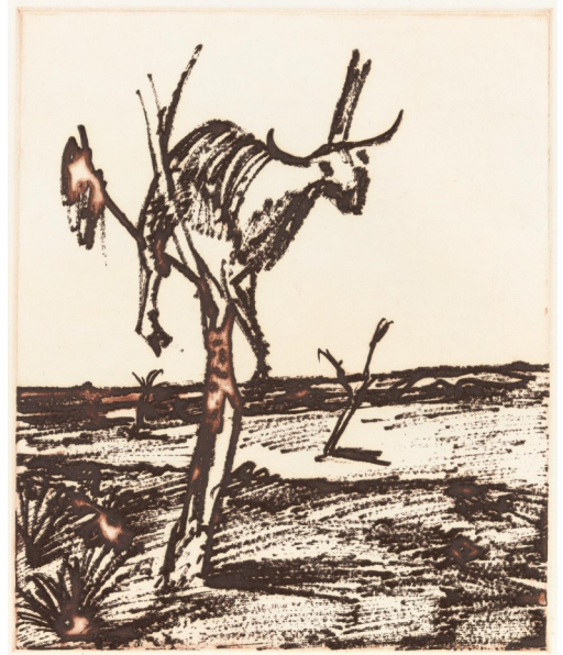
Sidney Nolan, Carcase in tree, 1971