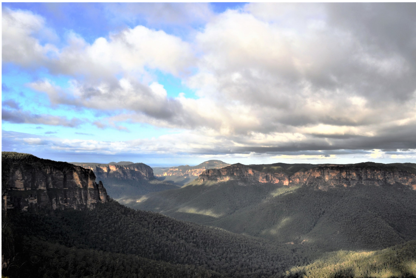
A Blue Mountains Outlook from Govetts Leap, Blackheath