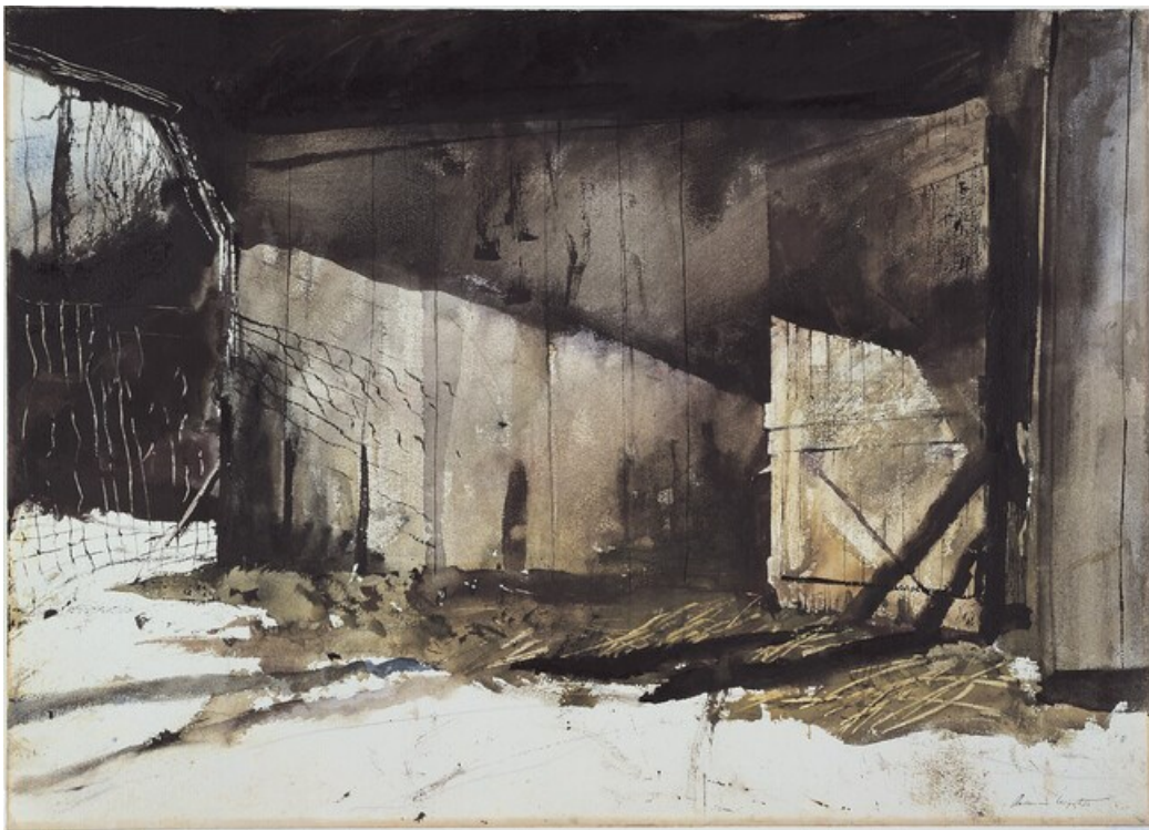
Andrew Wyeth – Winter Light, 1953

Yet all the precedent is on my side: I know that winter death has never tried The earth but it has failed: the snow may heap In long storms an undrifted four feet deep As measured against maple, birch and oak, It cannot check the peeper's silver croak; And I shall see the snow all go down hill In water of a slender April rill That flashes tail through last year's withered brake And dead weeds, like a disappearing snake. Nothing will be left white but here a birch, And there a clump of houses with a church.