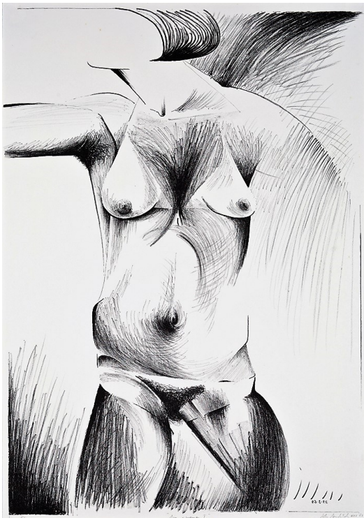
Sun-Woman-I, lithograph, 1969