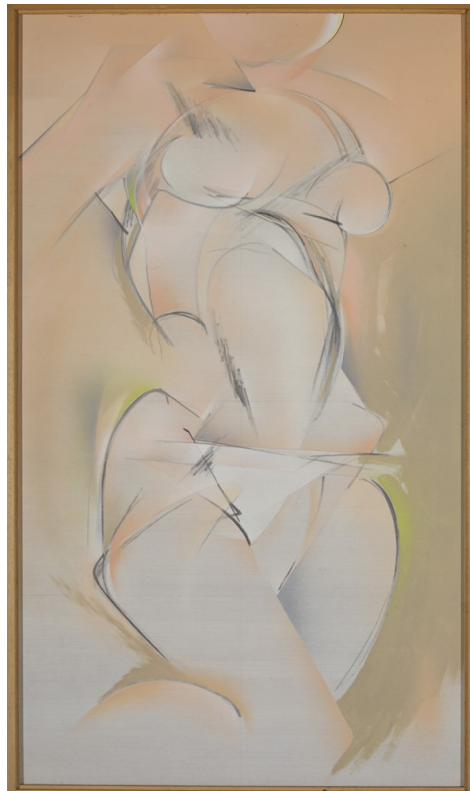
Cover 18 (Terrible Hard), 1975, acrylic and pencil on board, 137.4 x 91 cm