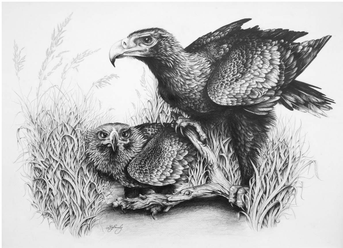
Magnificent Wedge-tailed Eagles by Lisa Kennedy - Graphite on paper, 84.5cm x 109cm