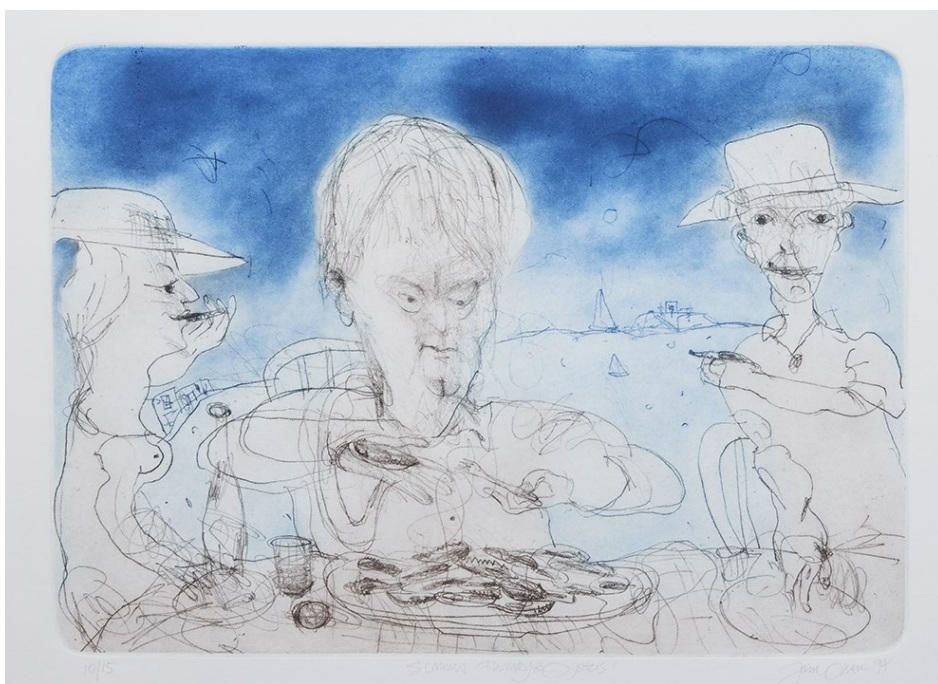
John Olsen (1928 - 2023), 'Seamus Heaney and Oysters' , 1994, etching 68x72cm