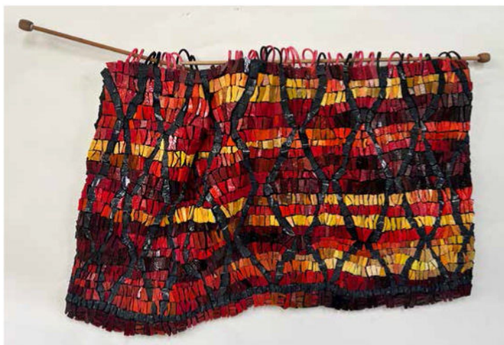
Keep Me Warm 2023, marble, venetian glass, cord, knitting needles, 43 x 29 x 5 cm

Braemar Gallery, 104 Macquarie Road, Springwood Thursday - Sunday 10am-4pm email: braemargallery@gmail.com