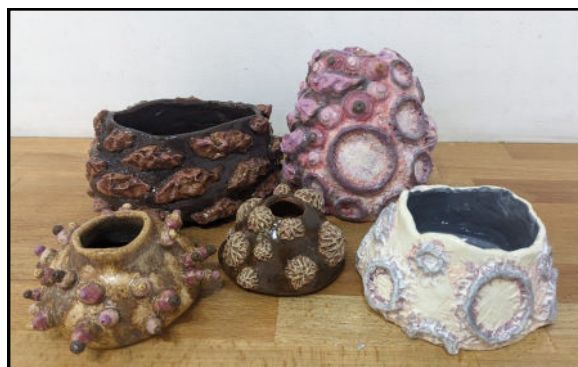
Pheony Ban Highly commended