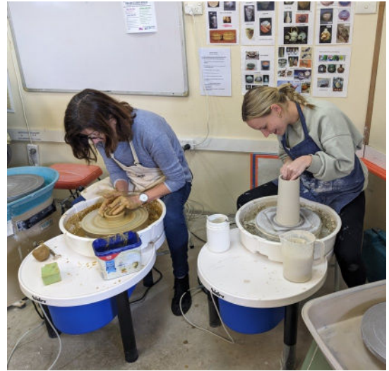
Saturday potters testing our new shimpo wheels.

Our drop in and pot groups are not for beginners. They are for potters who have some experience, that can work on their own projects in a supportive and collaborative environment. If you are a new member and wish to join a group please contact the facilitator through the facebook page before attending.