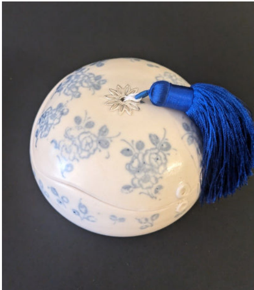
Trinket box by Bronwyn Campbell