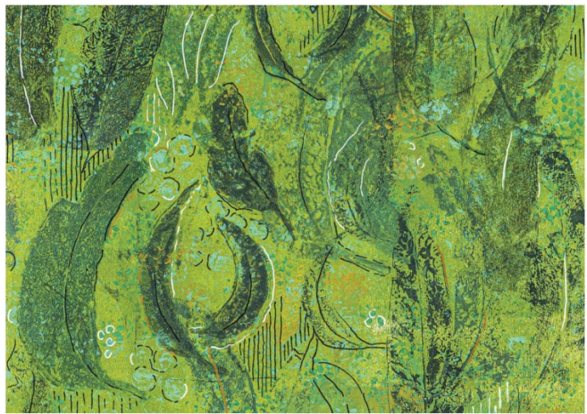
JEANNIE MCINNES-GREEN Pathway 2023. Monoprint 30 x 42 cm