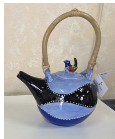
Bronwyn Campbell's pots & teapot