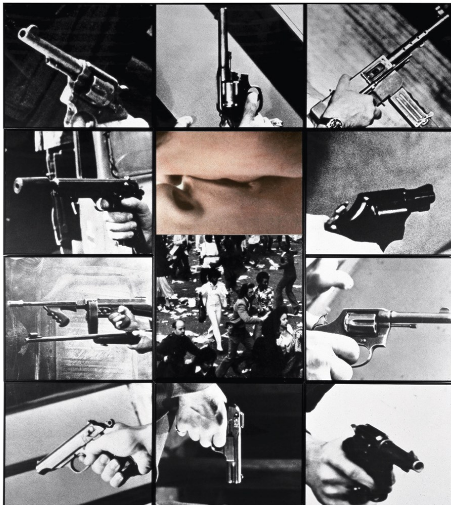
John Baldessari, Kiss/Panic, 1984

The aftermath always happening like an airplane falling, or a man midair falling from a horse, and an arrow, a gun, many guns pointing away, at us, our all bull's-eye-on-the-mark. This is what he sees when he sees. Maybe Wrong or not, the appropriation, the film clip, chase, pressed lips over lips, photo moment on the minute-drawn breath in, the over, the under, bodies in black and white cut to pose, the way a kiss can pose, dispose of everything around it for another, dispose of thinking. It's like waving good-bye. Mouth to mouth seeing as saying. Inside. Resuscitation back to the brain saying yes as the mouth makes an O. Circles for the digital age, colored dots for faces already made for erasing. Hurry, come, he, 6'7", sees fifteen minutes from the Mexican border, cremates his old paintings up close. But the ashes were kept in a book urn, not so afloat in the ocean with my parents, Above, On, and Under (with Mermaid) to kiss and kiss, riot in the dark depth of it. The collision, the kiss, the capture, once in the for-all-we-know of haunting who comes first. Kiss into kiss and so into kiss. All laws of gravity leave us. Gender begins in violence and space. Space begins in gender and violence as all laws of gravity leave us. So, kiss, kiss, kiss!