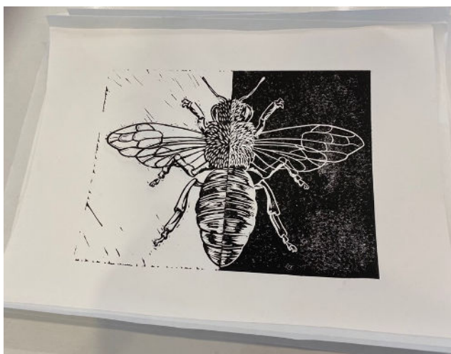
Laura's first lino print beautifully cut and printed .