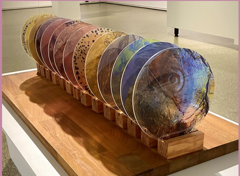
Cheryle Lin-Yo at Lane Cove Gallery