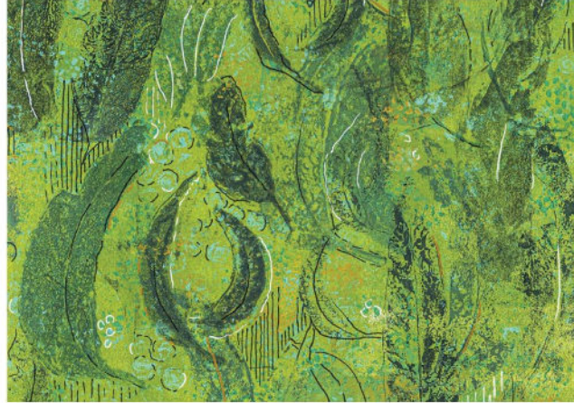
JEANNIE MCINNES- GREEN Pathway 2023. Monoprint: 30 x 42 cm