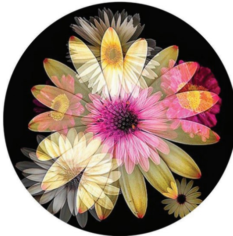
ROBYN COOK My Garden #2 2023. Digital double exposure print, flowers. 46.5 x 46.5cm