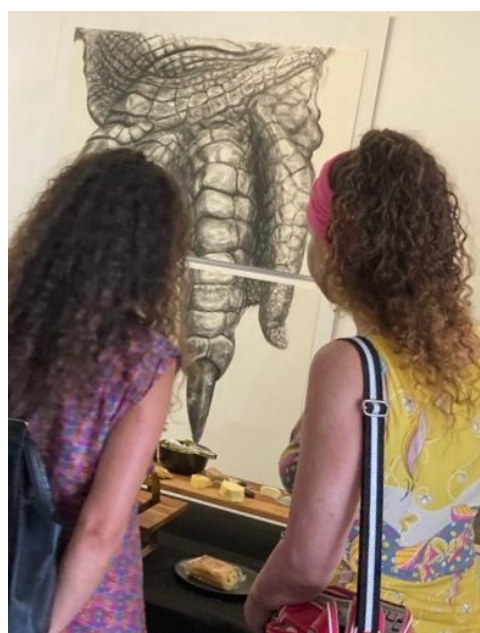
Admiring the Diptych