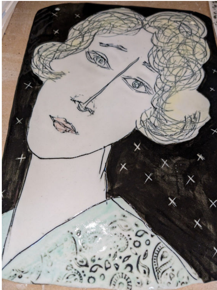
Ceramic tile and hanger fresh out of the kiln by Cathy Campbell. Underglaze and carved decoration, stoneware clay, fired to 1280.