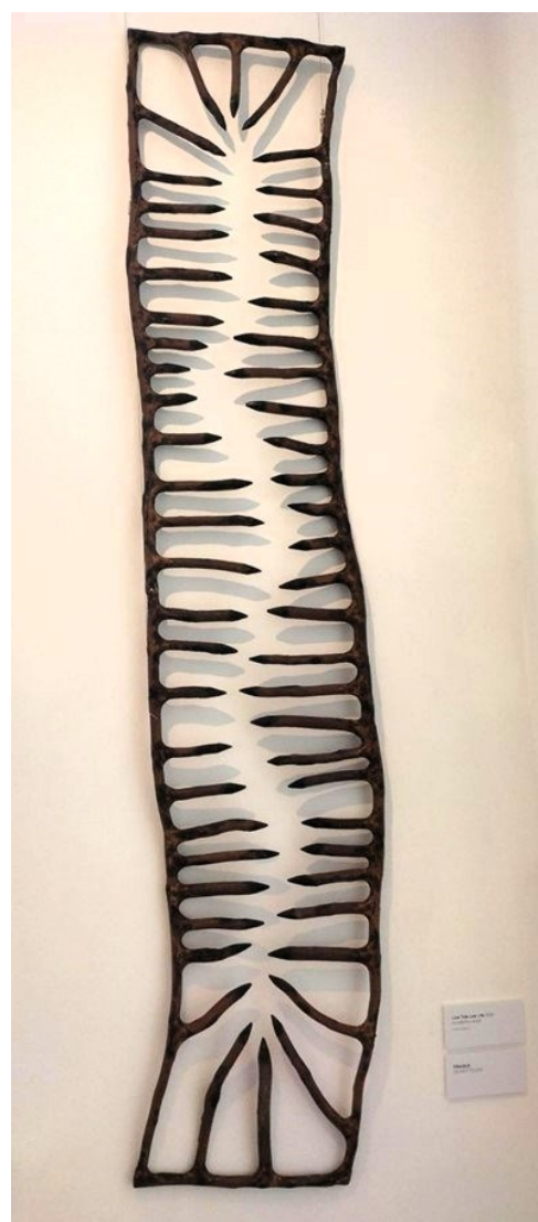
Low Tide Low Life , 2008, Eucalyptus wood, 180 x 40 cm, Collection of Felicity McGregor