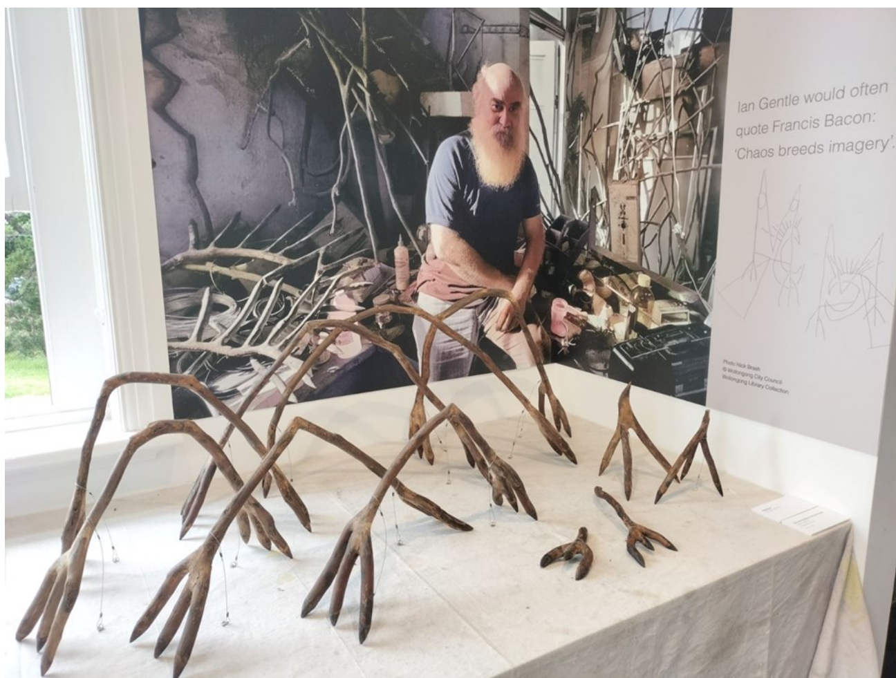
'The Gentle Project' at Clifton School of Arts and Wollongong Art Gallery (see p. 12)

The date for the AGM has been changed and will now be held on Thursday night 7 th March, at 7pm in the main room.