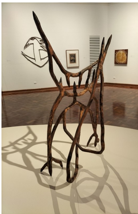
Bush Rat , ca.1992, Eucalyptus wood, 83 x 50 x 39 cm