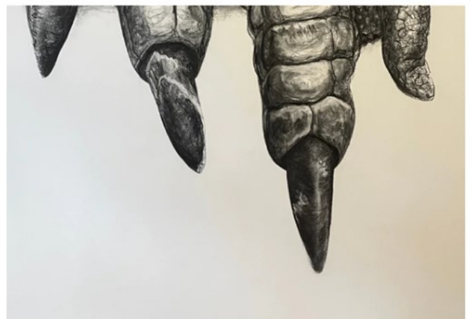
Omnipotence , Charcoal diptych, 163.8cm x 109.4cm