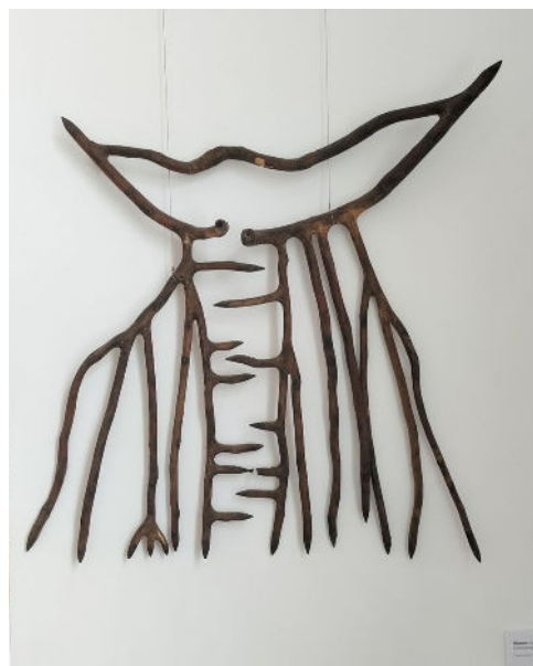
Mossie , Eucalyptus wood, date unknown

Our visit was altogether an inspiring adventure. This lovingly curated exhibition continues to 3 rd March Wollongong Art Gallery. Gentle at Clifton finishes at 5 pm on Sunday 25 February.