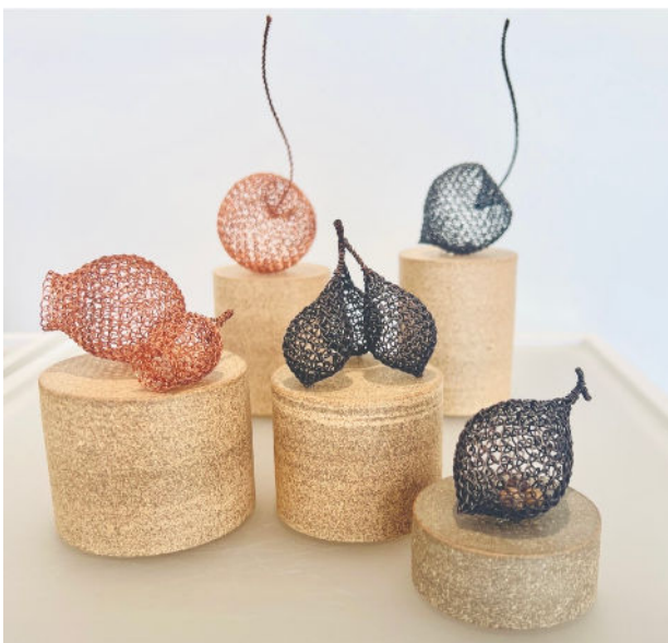
Pericarp plinth pieces by Asahi So. Petite works 8 - 11cm high, including ceramic plinth. Stoneware and wire.