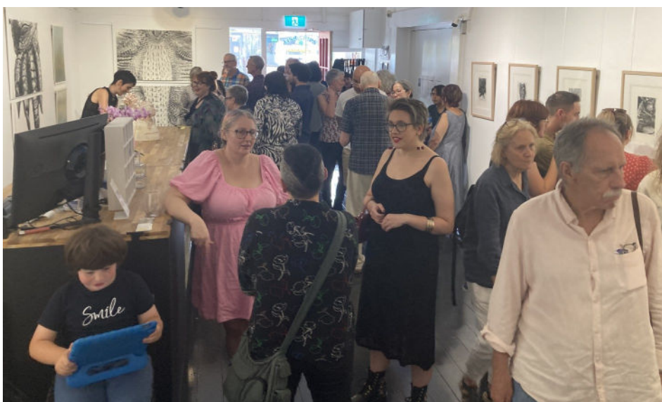
Full House for Katrina's exhibition at Gallery NWC ,Katoomba