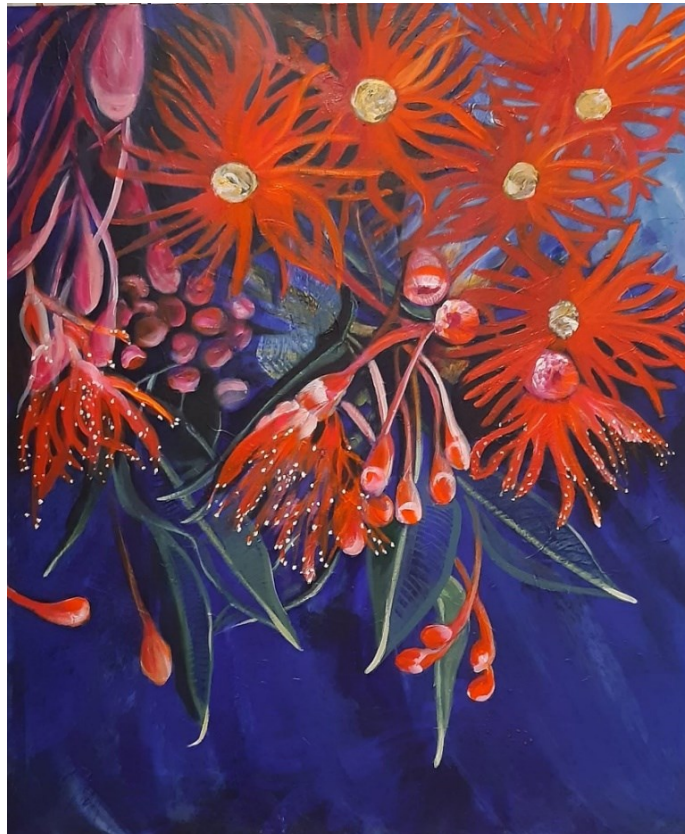
Sally Thompson, Firecracker, 2024, 100 x 120cm

Instagram: https://www.instagram.com/salt_gallery_designs/