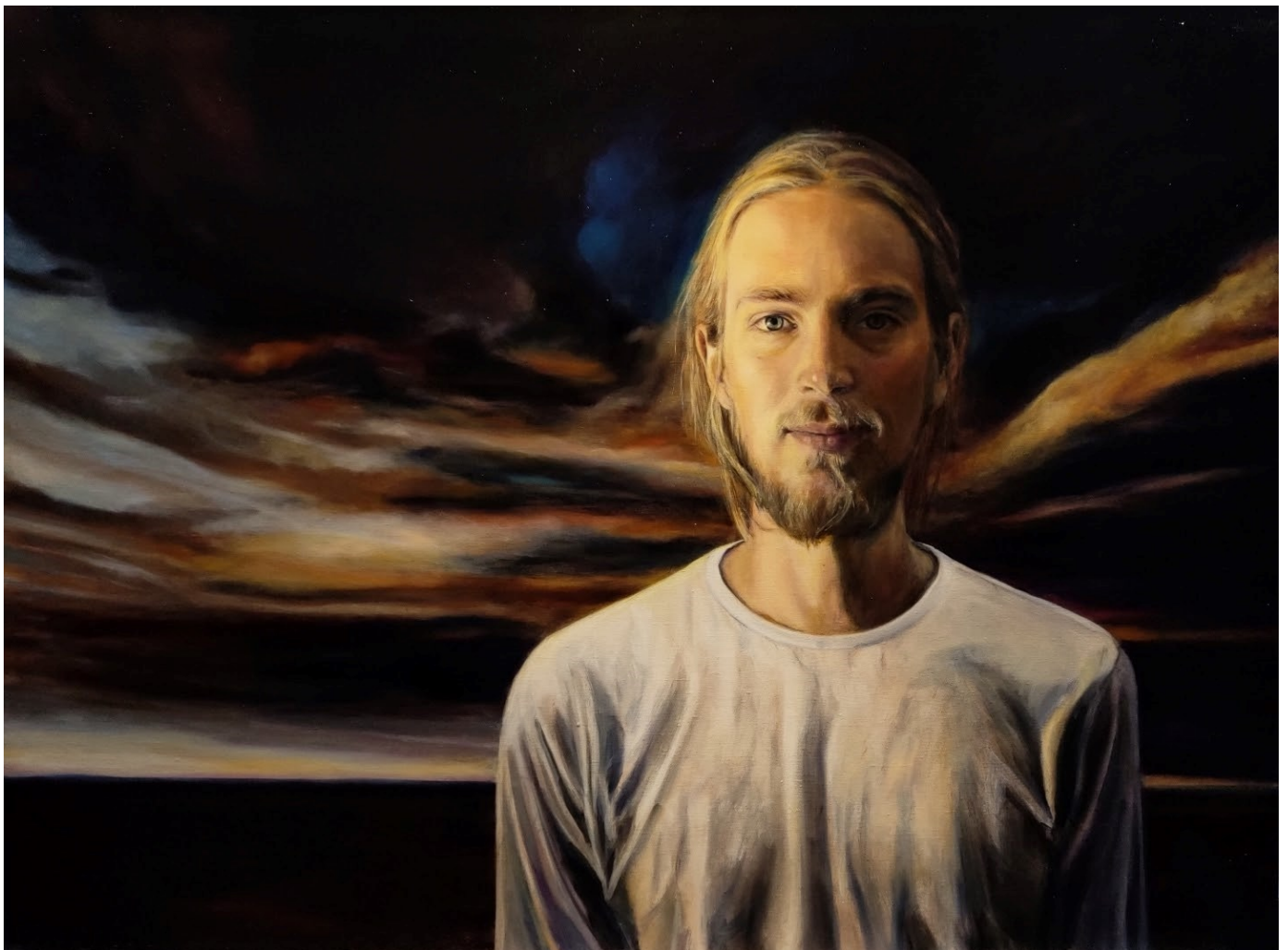
Catherine McCorkill, 'Ivor Houston: On Foot Across Australia' , Oil on Linen, 2022, 36 x 48 inches

Main prize winner- People's Choice, 2023 Blue Mountains Portrait Award, Katoomba, Blue Mountains Cultural Centre.