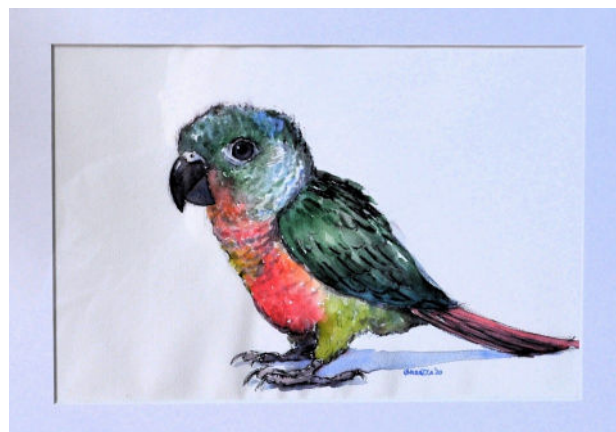
Gus Carrozza, Billy , watercolour pencils