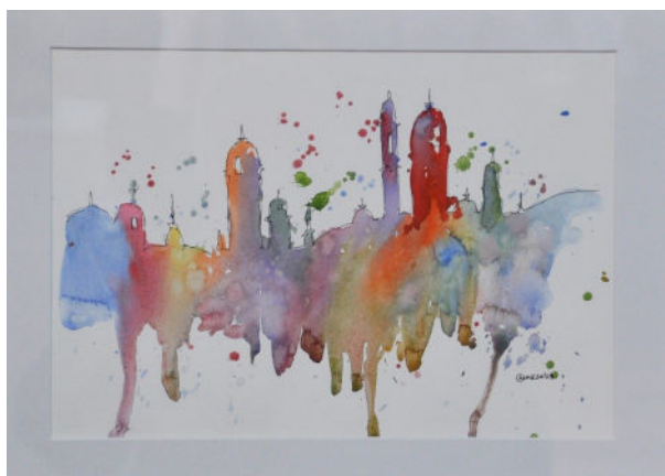
Gus Carrozza, Skyline , watercolour