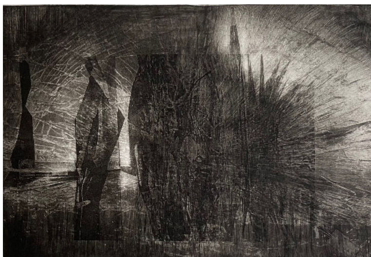
Joy Myers Creed, Epiphany , solar plate etching