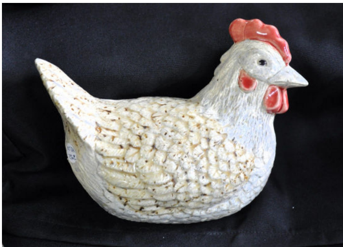
Alison's Ceramic Chicken