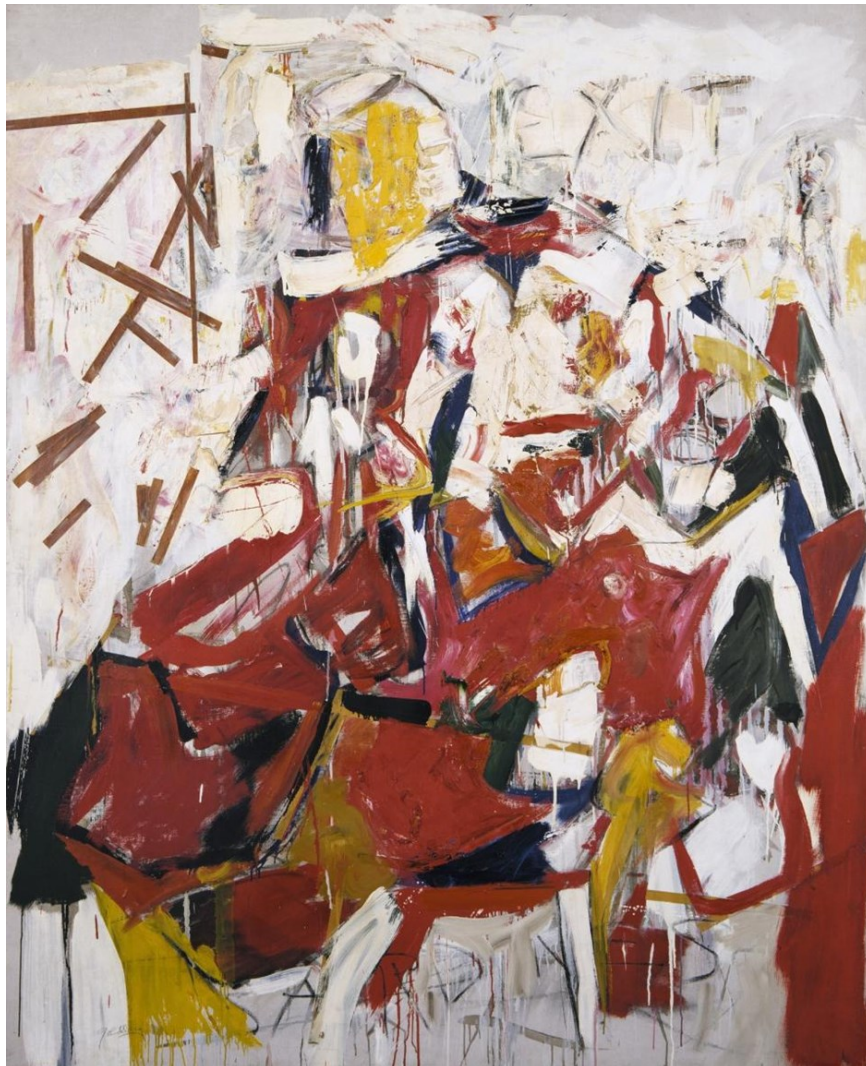
Michael Goldberg , Sardines , 1955, oil and adhesive tape on canvas, 205. 1 x 167. 7 cm. Smithsonian American Art Museum

But me? One day I am thinking of a colour: orange. I write a line about orange. Pretty soon it is a whole page of words, not lines. Then another page. There should be so much more, not of orange, of words, of how terrible orange is and life. Days go by. It is even in prose, I am a real poet. My poem is finished and I haven't mentioned orange yet. It's twelve poems, I call it ORANGES. And one day in a gallery I see Mike's painting, called SARDINES.