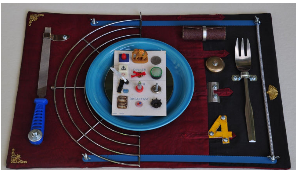
Rudi Christen, Diet 4 an Iron Constitution , collage of found objects