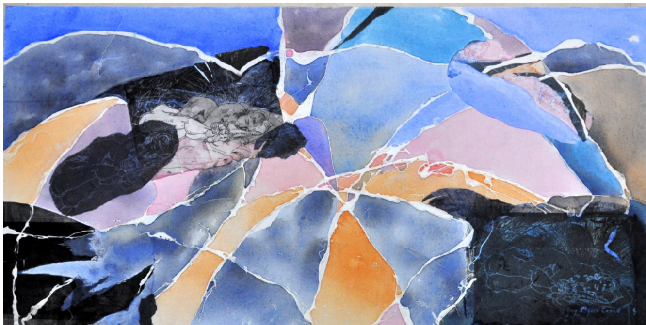
Joy Myers Creed, Coalescence , mixed media