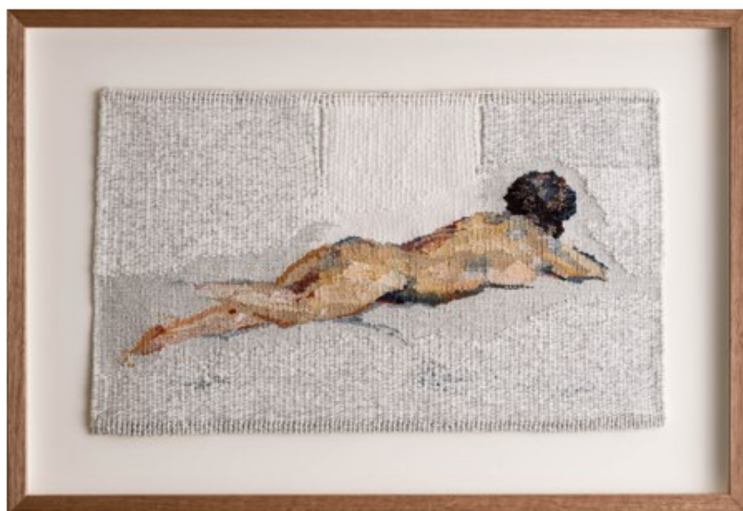
'Woman Resting, Colour ' - Susie Summers. Cotton Tapestry. 41cm x 60cm

A stunning exhibition of figure and landscape tapestries by a local Blue Mountains artist.