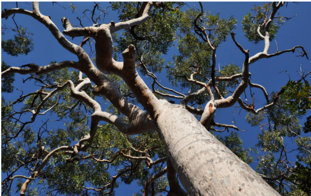
Encounter near the Bluff: Anne Gough-Ra (Angophora)

Our 'Hare Street' Centre is located on the traditional homeland of the Dharug and Gundungurra people. We recognize and pay respect to the traditional custodians of country past, present and emerging.