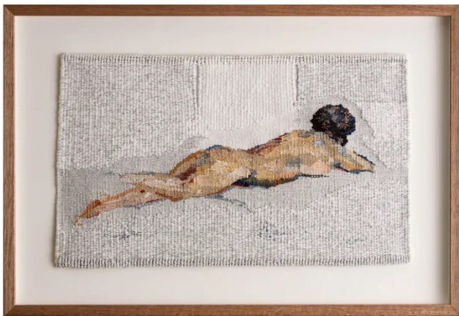
Woman Resting, Colour , Tapestry, cotton, 41cm x 60cm (incl. frame)

I love tapestry weaving. I love the quality of the lines, the pixelated & textured effects, and the ability to mix & blend thin strands of colour to achieve different shades".