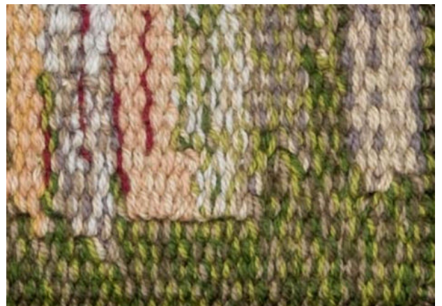
Tall Gums (detail)