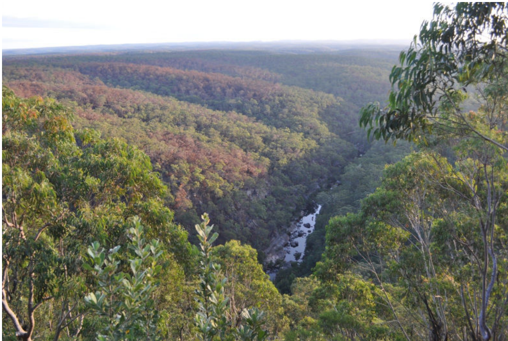
View from Chalmers Lookout in Glenbrook's Bluff Reserve