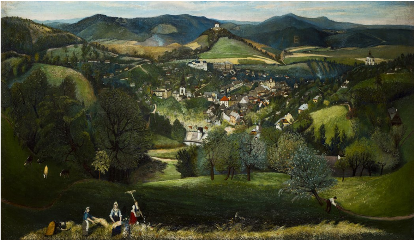
Csontváry (1853-1919), 'View of Selmecebánya' (1902), Csontváry Museum, Pécs, Hungary.

Tivadar Kosztká, later known as Csontváry, was a Hungarian pharmacist who decided, aged forty, he would become 'the greatest plein-air painter in the world, greater than Raphael'. Disregarded during his lifetime, his work is now accepted as that of a visionary genius.