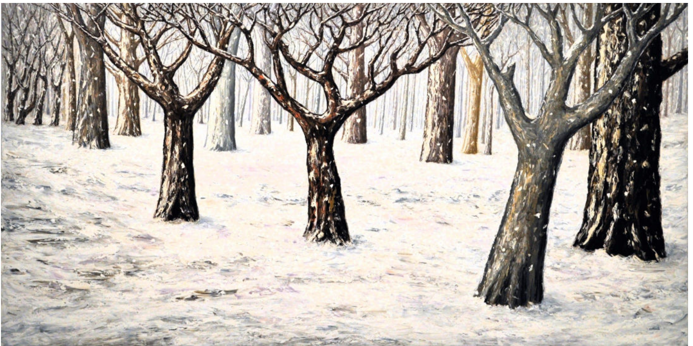
Peter Booth, Winter , 1999, Oil on canvas, 203.4cm x 396.5cm

The inscription quoted is from a plaque in Washington Square, Philadelphia, whose ground also holds graves of Revolutionary soldiers from the War of Independence (1775-1783).