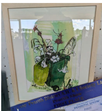
Joy Myers Creed

Joy Myers Creed was placed first for her unique still life painting arrangement of discarded flowers in the top of a green bin.