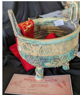
2nd. Open Throw