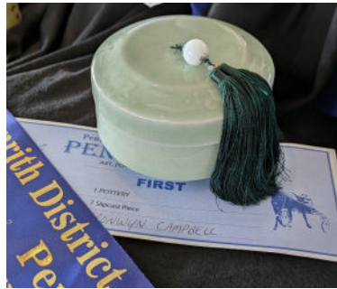
1st. Slip Cast