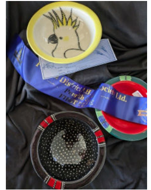
1st. Functional Set

The Nepean Potters , who donated $300 towards the prizes, usually organise the pottery section of the show. They volunteer to accept and record entries, set up the display and man it over the Saturday. They also had a number of winning entries.