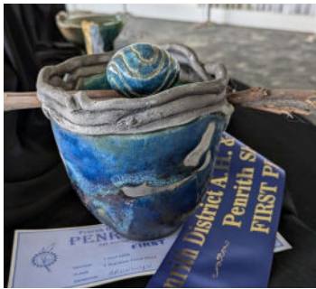
1st. Low Fire (Raku)

First and Second in the newly created section for slip cast pots: a carved celadon trinket box and a small space ball trinket box decorated with texture underglaze and gold lustre.