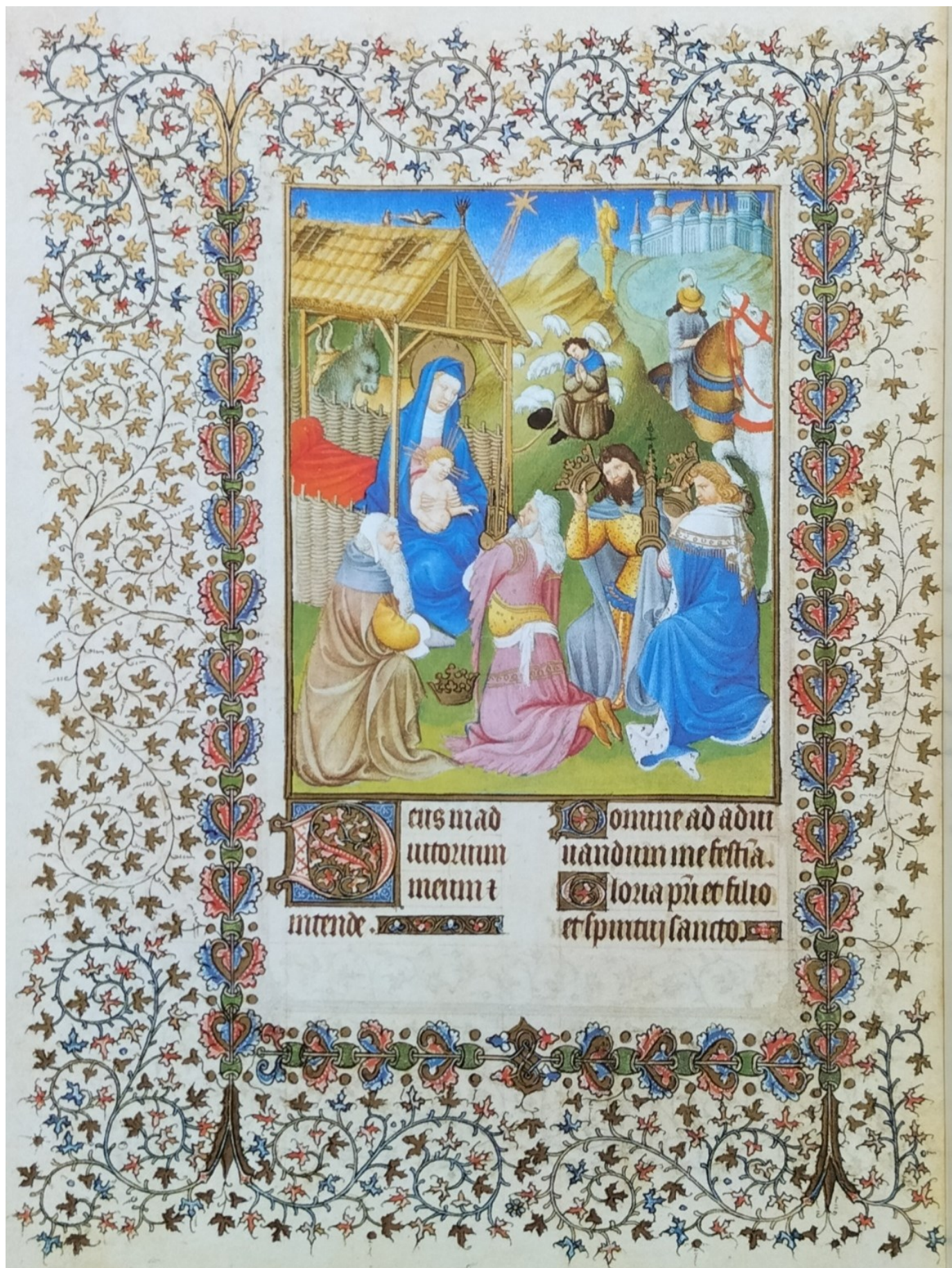
The Adoration of the Magi , Illuminated Folio from 'Les Belles Heures de Jean Duc de Berry', ca. 1409.