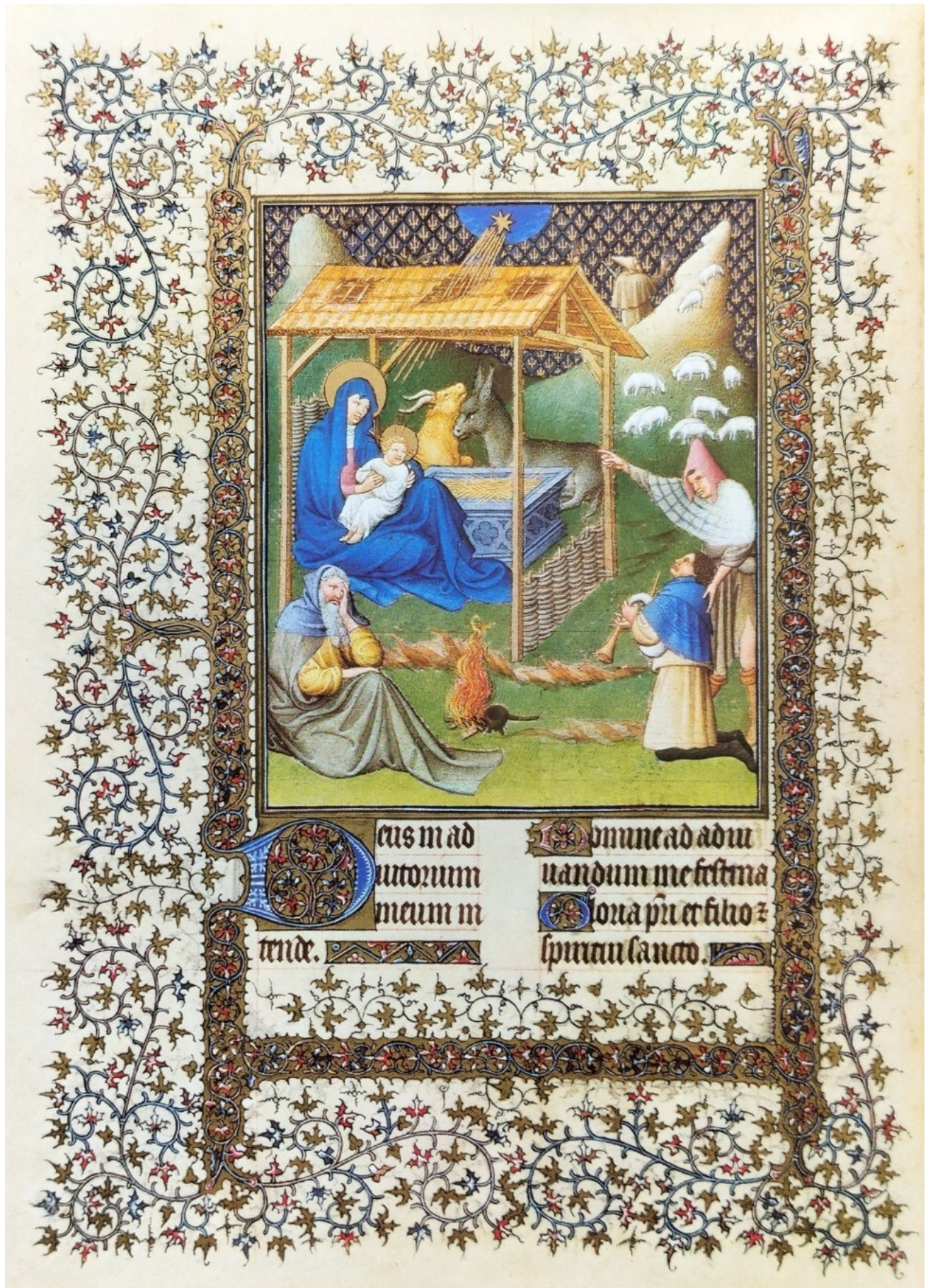
The Nativity , Illuminated Folio from 'Les Belles Heures de Jean Duc de Berry', ca. 1409.