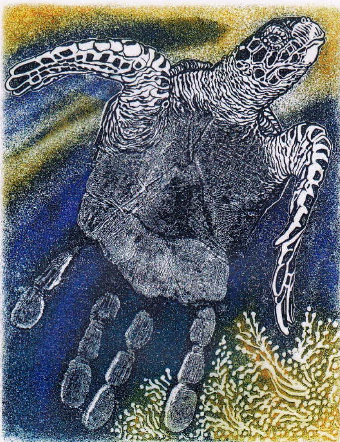
Janet Saunders, Rise up Hawksbill, 2023, intaglio solar etching, 21 x 16.7 cm