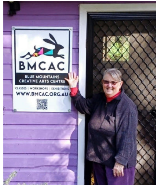
Beverley at the Centre entrance