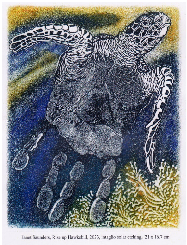
Janet Saunders, Rise up Hawksbill, 2023, intaglio solar etching, 21 x 16.7 cm