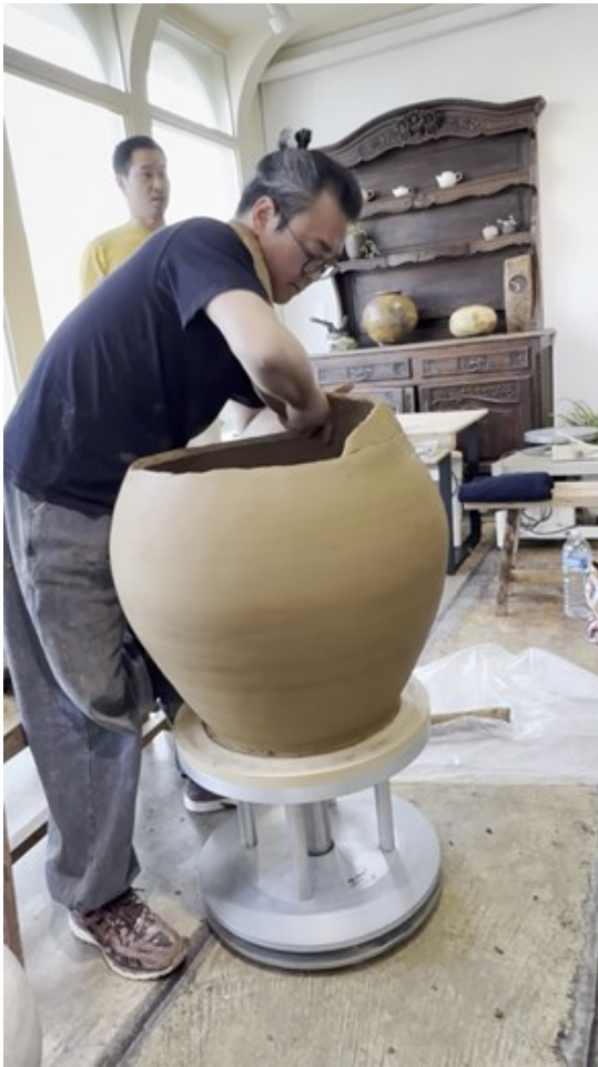
The Onggi master at work.

Working on greenware prepared by the masters we learned traditional Buncheong and Samcheong, (which by the way the Thursday classes have been learning) stamping and carving, then inlaying with slip; also carving through multiple layers of coloured slip, hole piercing and calligraphy. We watched a demonstration of traditional Onggi making and visited a number of ceramic museums and galleries around Icheon and Seoul. Needless to say, I had a great time and learned heaps!