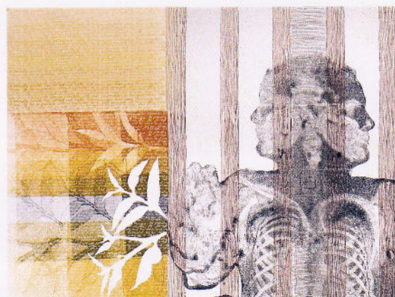
Janet Saunders, Resilience, 2025, (detail), monoprint/mixed media, 220 x 180 cm