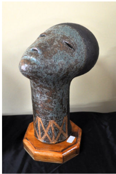
Marianne Pollpeter, ceramic sculpture