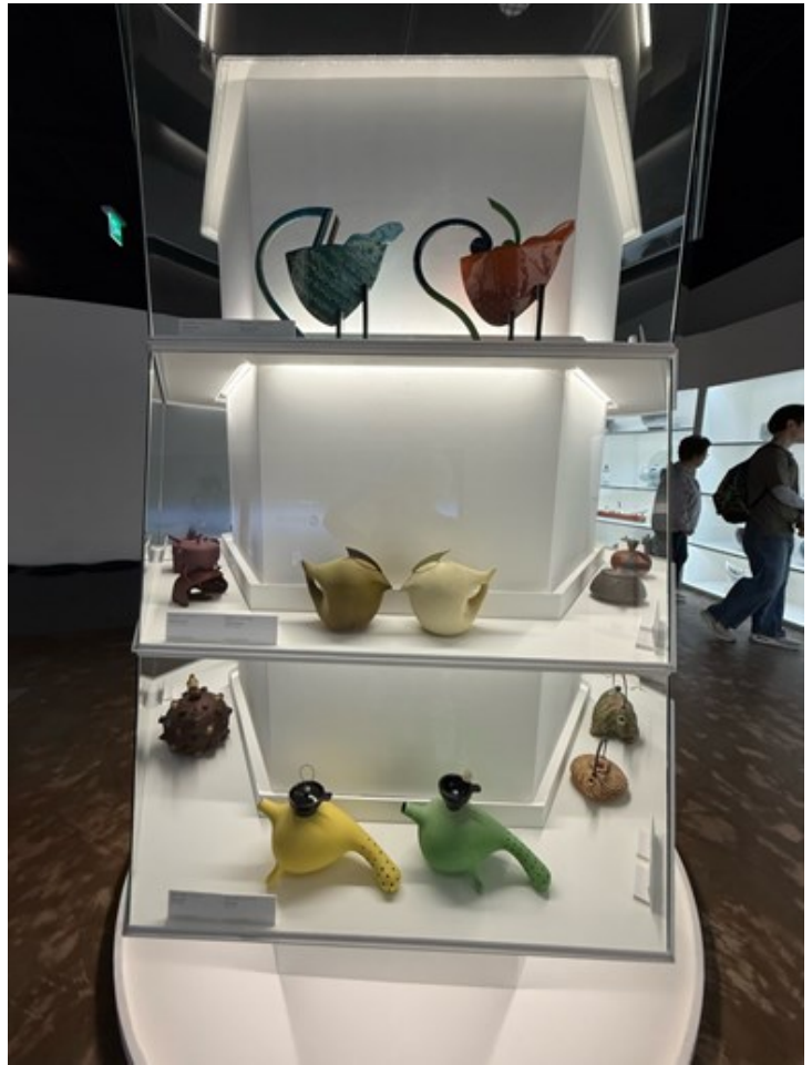
A selection of teapots at the Museum of Contemporary Ceramics