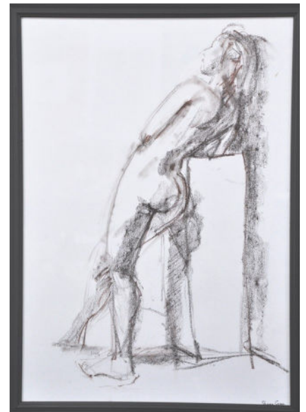
Sheree Green, Emily , charcoal & pastel