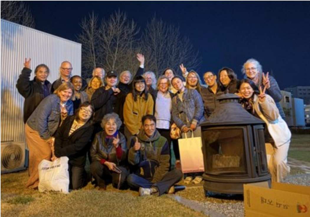
Potters on tour.