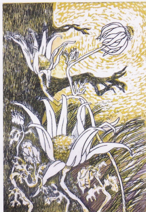
Janet Saunders, Break Away, 2025, polystyrene and Perspex etching, 27.5 x 20 cm