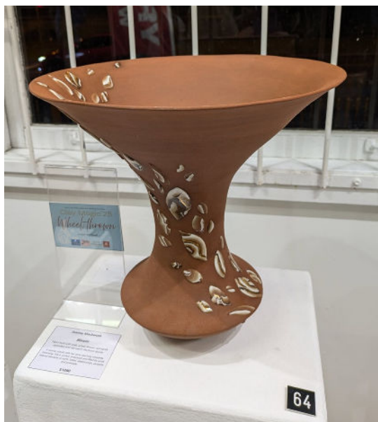
1st. in the Thrown section. No glaze except on the little shards areas.

Hello everyone, finally I have time to fill you in on some of my activities since moving to Coombabah, Queensland. I have settled into a small 3-bedroom, 2-bathroom, 1 study, double garage house. After a few weeks of painting and bathroom renovating, I finally moved in at the end of May. I am only 11 minutes from both my children and 5 mins