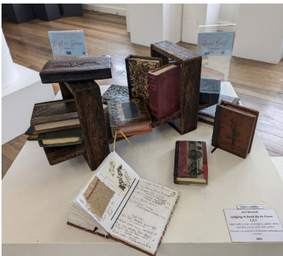
1st. in Hand-Building.

The hand-building first prize was a set of little books. Each cover had a different pottery glaze technique. It included one little book with handmade paper pages that was a diary and included delightful sketches.