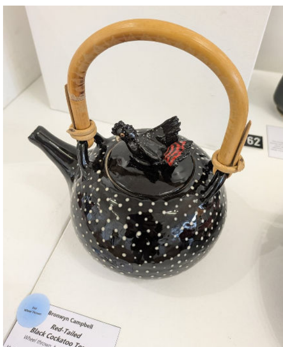
2nd. Place in 'Thrown' by me.

from Runaway Bay shopping Centre. I am across the road from a very large park and 3 other small parks only a block or two away. Kangaroos visit the park most nights. The 40km zone in the area helps to keep them safe. This area is connected to quite a huge protected natural reserve that houses many kangaroos and over 200 koalas.