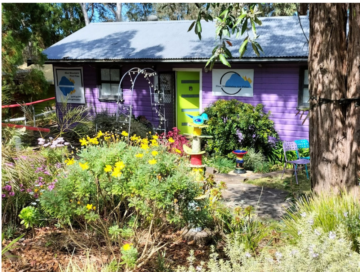
Spring blossoms abound at our Centre.