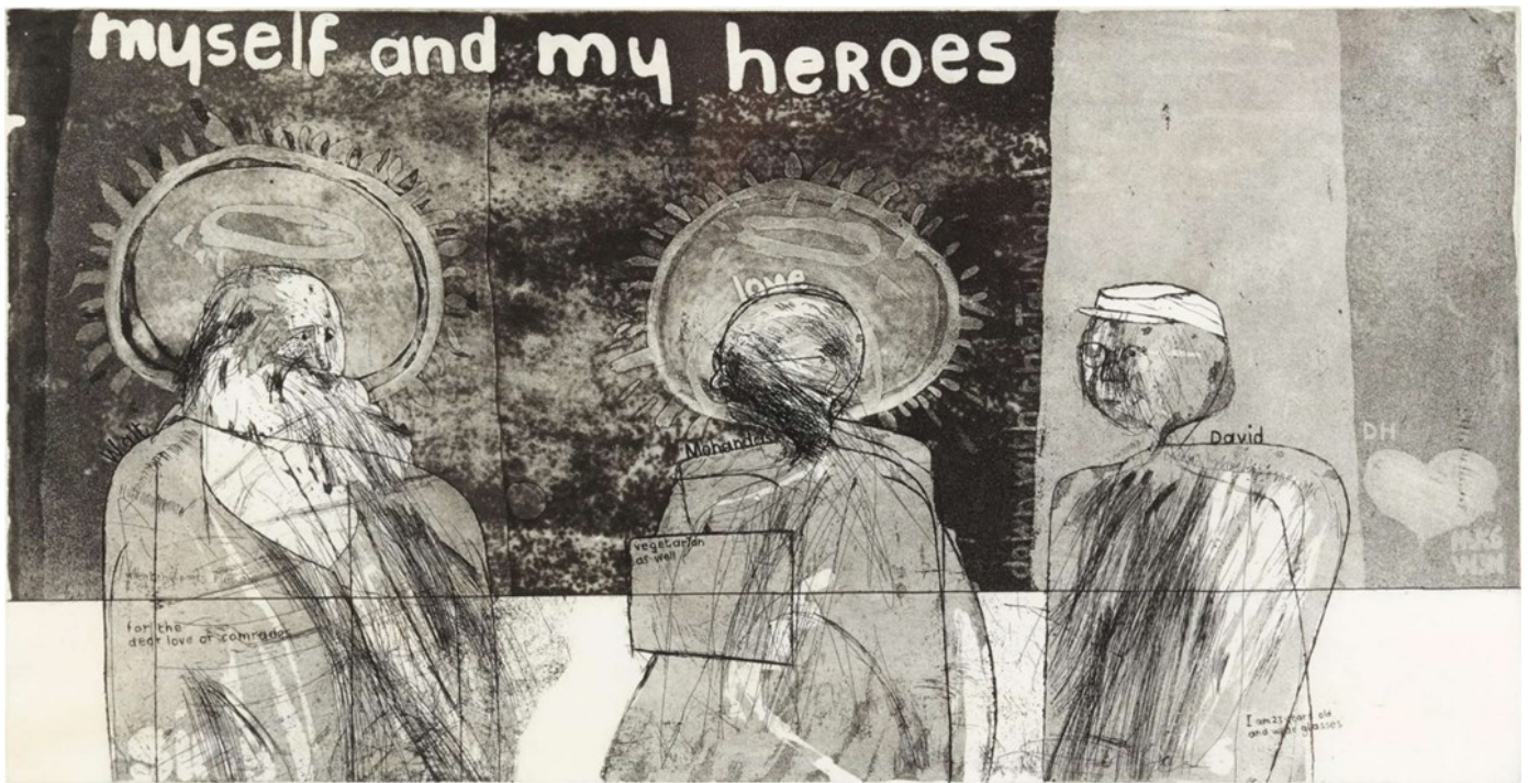
David Hockney, Myself and My Heroes , 1961