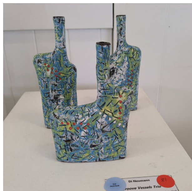
3rd. in Hand-Building