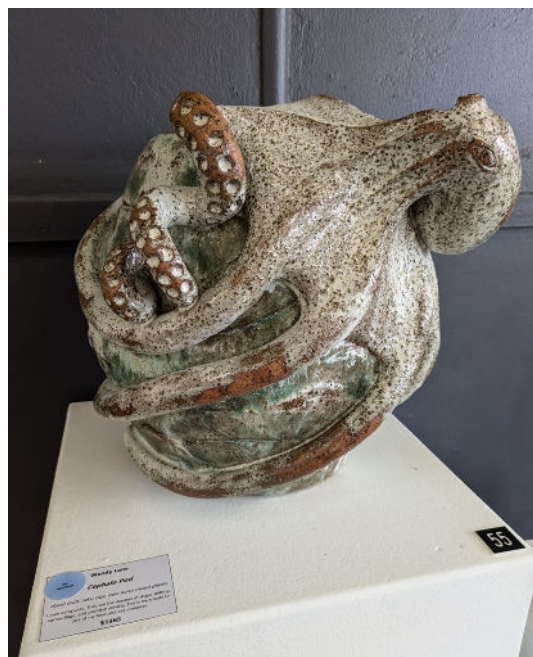
2nd. in Hand-Building.